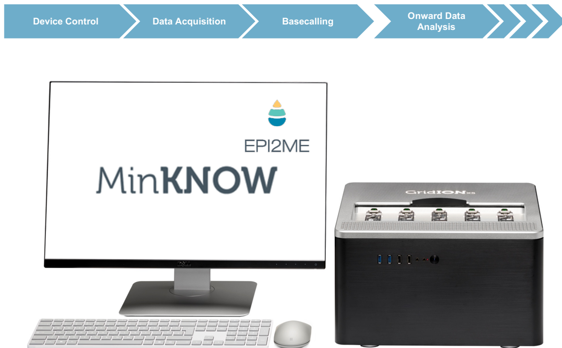
Figure 1: Default data analysis workflow of the GridION device

All device control, basecalling, analysis and orchestration on the GridION is carried out by pre-installed custom software created by Oxford Nanopore Technologies. The default data analysis workflow when using the GridION X5 is as below: